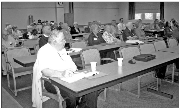
PURA officers and committee members gather for the annual planning meeting in Stewart Center in June.